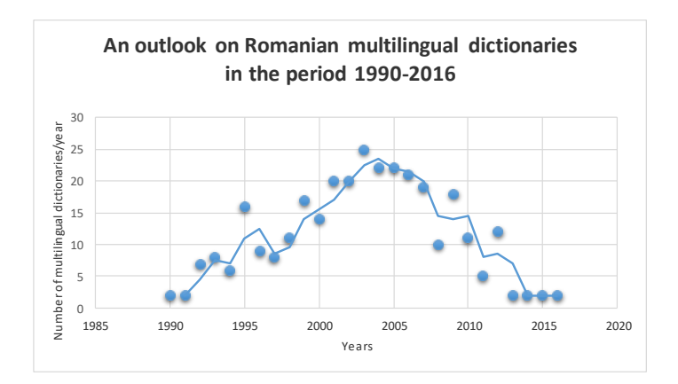
Figure 1: An outlook on Romanian multilingual dictionaries

The object of our study refers to the categories of users and the contexts of dictionary use considered by multilingual dictionary (with at least three component languages) authors who published their works in Romania after the sociopolitical events in 1989 known as 'the Revolution of December 1989'. The framework of our research requires the analysis of relevant data from a limited, but representative sample of multilingual dictionaries issued after 1990. The research aim refers, on the one hand, to the identification and systematization of the main categories of users and on the other hand, to the identification and (brief) description of contexts of dictionary use. According to the data provided by the first and only inventory of Romanian multilingual dictionaries (Pricop et al. 2017: 175-339), in the period 1990–2016, 303 such works were drafted and published, of which 86 titles were issued in the period 1990–1999, 202 titles in the following decade and 25 titles in the period 2011-2016. Taking into account the fact that for the decade that ended with the events in 1989, namely the period between 1980 and 1989, there are 27 titles (Pricop et al. 2017: 160-174), one can note a lexicographic 'boom' of a multilingual type in the period 1990–2010, with an obvious peak between 2001–2006 and a visible decline after the year 2010 (see Figure 1).