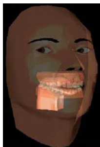
Figure 5: Baldi going transparent

The so-far lexicographically unimplemented type of potentially pedagogically useful phonetic representation is articulatory animation. Realistic avatars of the Baldi kind ( http://mambo.ucsc.edu/pdf/WilliamsRDD.pdf ) could be used, with speech animated in real time. Different perspectives, zooms, transparencies and tempos could be used (see Figure 5 below). The animation can be coordinated with a human recording or with TTS output. The technology is now mature for use in e-dictionaries. The benefits for e-dictionary EFL users are too obvious to elaborate on.