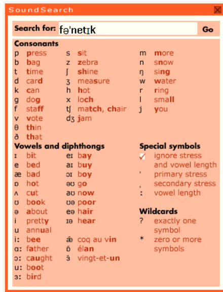
Figure 1: MEDAL1 SoundSearch phonetic keyboard

This is certainly a step in the right direction. Learners can now scan the dictionary for problematic homophones or phoneme clusters; teachers have an excellent tool for material and test preparation. As with many such new developments in contemporary lexicography, it remains to be seen just how user-friendly and useful these new access methods are in the actual EFL practice. Needless to say, there is practically no research yet in this area.