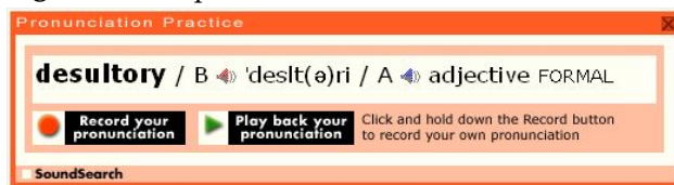
Figure 4: "Repeat after me" exercise in MEDAL1

This limitation, however, is not one of technology or pedagogy, but of imagination. For example, pronunciation practice could easily be combined with flashcards. Why is it that the only elements of an entry's microstructure used in flashcards are its headword and definition? Why not let the learner "type the mystery word" in response to its phonetic transcription or recording (dictation), or both, as well as to its definition? Why not flash the headword and ask the learner "Do you remember how to pronounce this word?", as well as "Do you remember what this word means?", the only option now built in?