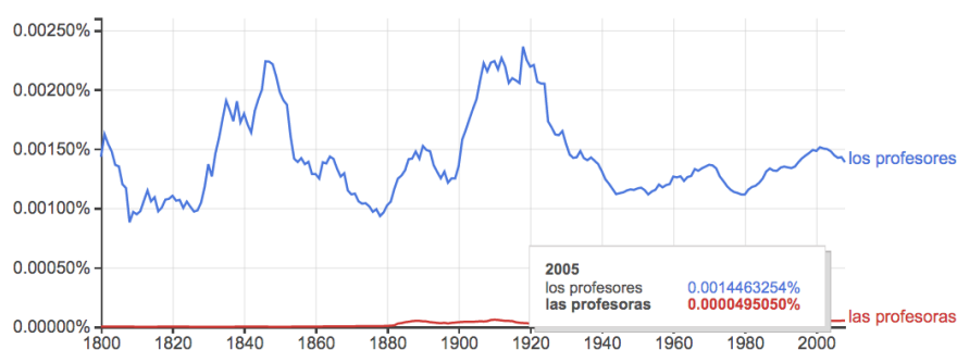
Figure 5: Rate of Frequency of los profesores and las profesoras in Google Books Ngrams

Thirdly, the definitions of profession nouns include specific and generic explanations. By way of example, the Spanish word profesor is defined as (1) hombre que se dedica profesionalmente a la enseñanza, es decir, que está especializado en una materia, disciplina académica, ciencia o arte determinadas y enseña a otras personas ('man who teaches professionally') and (2) persona (hombre o mujer) que se dedica profesionalmente a la enseñanza, es decir, que está especializada en una materia, disciplina académica, ciencia o arte determinadas y enseña a otras personas ('person, i.e. man or woman, who teaches professionally'). The generic definition is recorded under the headword that occurs typically in Spanish. For instance, in Google Books Ngram Viewer, we observe that los profesores is around 30 times more frequent than las profesoras (Figure 5), and therefore we include the generic definition under the headword profesor . However, for the word feminista ('feminist') the generic meaning is under the headword feminista described with the articles una, la, unas, and las (Figure 2 shows that las feministas is 42 times more frequent than los feministas ):