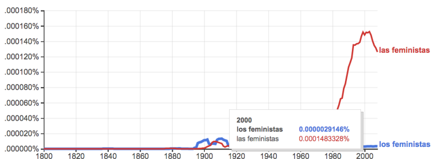
Figure 2: Rate of Frequency of las feministas and los feministas in Google Books Ngrams

Fourthly, Spanish lexicographers use both rules that exist only in formal grammars as well as taken-for-granted traditions. These rules do not always work in language, especially in informal face-to-face encounters. Fuertes-Olivera (1992), for instance, has shown that Spaniards use social gender with some nouns (e.g. those relating to a profession). Social gender implies the use of male or female generics depending on users' social expectations and conventions. For instance, Spanish mainstream newspapers have recently used and continue using headlines such as Las feministas se manifiestan contra la sentencia de la Manada instead of Los feministas se manifiestan contra la sentencia de la Manada [the former is feminine and the latter masculine, and the headlines refer to the uproar caused by the rape of a young woman at the hands of a group of young men, identified as 'la Manada' ('the herd')]. Spanish newspapers use feminine generics ( Las feministas ) because Spanish society associates 'feminist' with women. This also explains why the generic expression las feministas is 42 times more used than los feministas in Google Books Ngram Viewer (Figure 2; see Pechenick, Danforth and Dodds (2015) for an analysis of some of the limitations of the Google Books Corpus). Such a figure would be impossible if the rules explaining the use of masculine words or expressions as generics were real. Instead, they are constructions based on the influence of power and ideology: