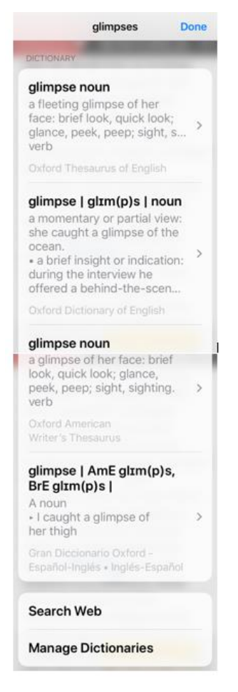
Figure 3: Articles from different dictionaries on iPhone

In Figure 2, a person reading an article from a South African newspaper on an iPhone does not understand the word "glimpses" and therefore touches the word with a finger. A little box is immediately displayed on the screen, on which a touch on "Look Up" gives access to a number of preselected dictionaries (Figure 3).