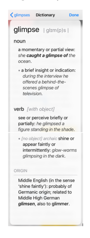
Figure 4: Dictionary article from Oxford Dictionary of English on iPhone

Hence, on the one hand, the user gets access to the lexicographical service directly in the context where the information need occurs, i.e. contextualization. On the other hand, the long road to the required data means that full contextualization is still a challenge to modern lexicography and producers of high-tech tools. Currently, companies like IBM are conducting comprehensive interdisciplinary research in order to develop a tool that can deduce the specific meaning of a word from the context. Unfortunately, and as far as we are informed, they have not yet come up with any convincing results.