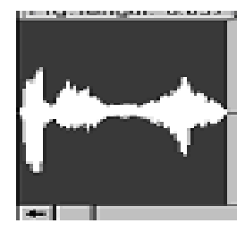
Figure 2: A waveform of Good morning ; model left, learner right

Similarly, a visual waveform representation of spoken words, increasingly more often provided as a thrilling multimedia extra, may offer multisensory feedback for practice, but is risky because "the visual comparison of the two sound waves, the model's and the learner's repetition [...] is at best inconsequential, and at worst thoroughly misleading and frustrating. The graphic representation of a waveform has a very complex relationship to its acoustic basis, and the latter to both its articulation and perception" (Sobkowiak 1997b: 335). Consider, for example, my own best rendition of Good morning compared with the native model in Figure 2. Should I not have known better, I would have been very frustrated by the dissimilarities between the two waveforms, apparently testifying to my complete mispronunciation of this phonetically easy phrase.