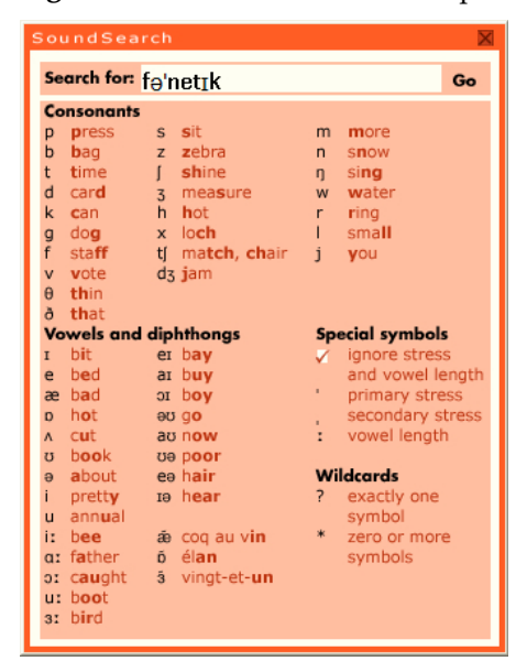
Figure 1: MEDAL1 SoundSearch phonetic keyboard

This is certainly a step in the right direction. Learners can now scan the dictionary for problematic homophones or phoneme clusters; teachers have an excellent tool for material and test preparation. As with many such new developments in contemporary lexicography, it remains to be seen just how user-friendly and useful these new access methods are in the actual EFL practice. Needless to say, there is practically no research yet in this area.